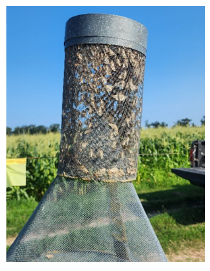
Corn earworm trap catch (2-night total) on 9 August in Eastville

Fall armyworm trap catches have been very comparable to last year although ESAREC entomology trials have experienced heavy fall armyworm damage in sweet corn.