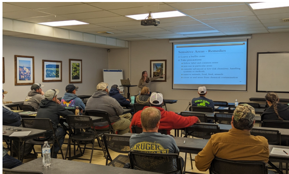
Private Pesticide Training at the Eastern Shore AREC on March 20th. Thirteen attendees received training and tested for the private pesticide applicator certification

Due to the excess amount of rejected containers at the Northampton Landfill, the drop-off storage container will be locked and people recycling will need to either contact Ursula Deitch, 757-678-7946 ext. 25 to schedule an appointment to drop off or go to the sign-in house and ask to have landfill supervisor, Ronald Rowe, come to inspect the containers prior to recycling them. We apologize for this inconvenience, however half of the jugs in the recycling container were rejected.