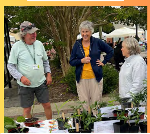
The Exmore Fall Festival was a good opportunity to educate the public on fall planting dates and for members to network