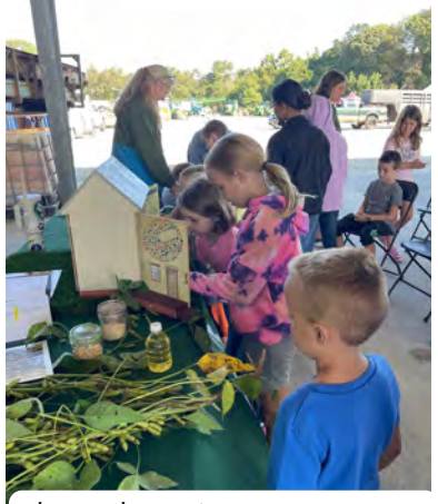
The Soybean Association was on hand to talk soybeans