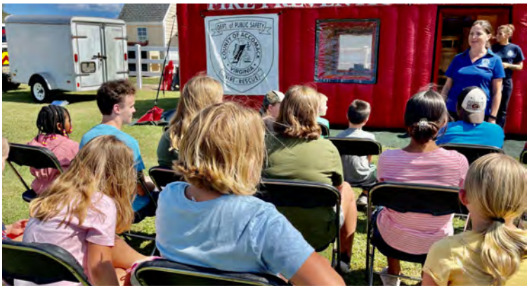
Thanks to Accomack County Emergency Services for their demonstration of fire safety in their smokehouse