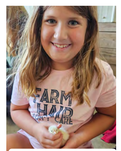
Tyson Food has always the most popular booth with baby chicks for children to hold