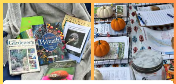
ESMG had gardening information available as well as books, pots and cuttings for sale